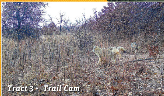
Tract 3 - Trail Cam