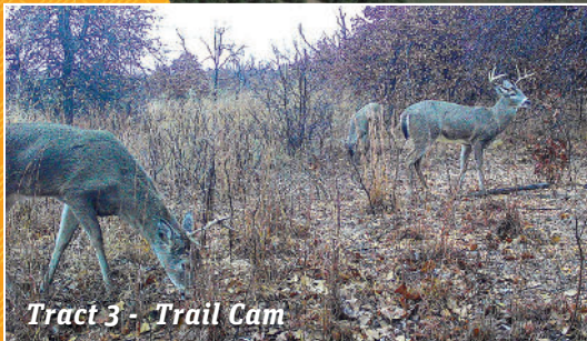
Tract 3 - Trail Cam