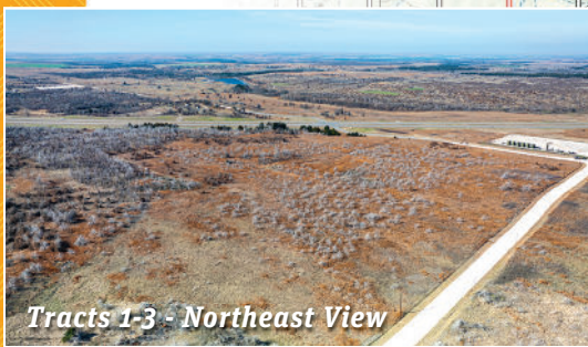
Tracts 1-3 - Northeast View