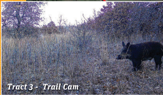
Tract 3 - Trail Cam