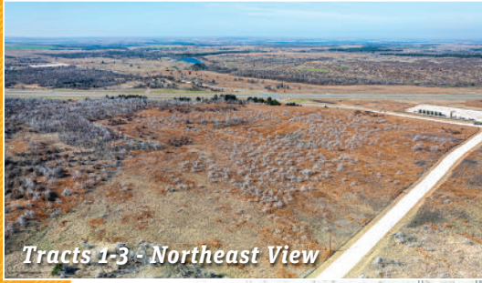
Tracts 1-3 - Northeast View