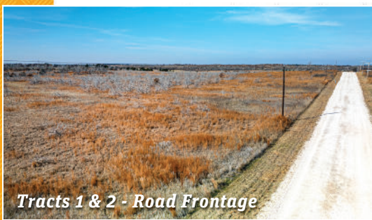
Tracts 1 & 2 - Road Frontage