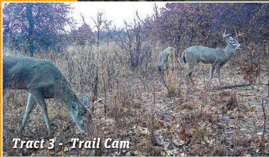
Tract 3 - Trail Cam