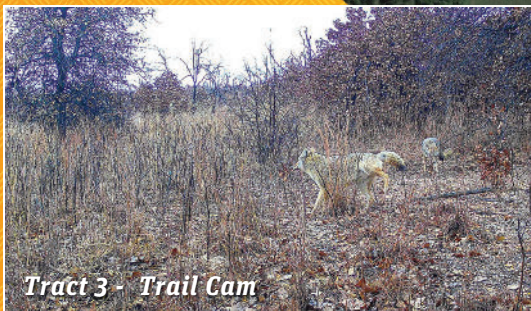
Tract 3 - Trail Cam