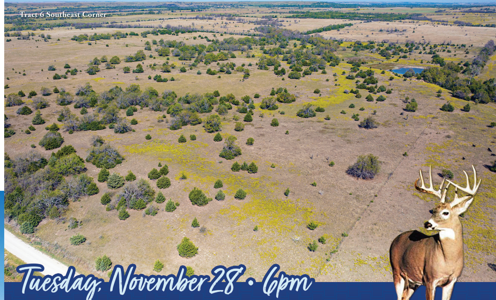
Tract 6 Southeast Corner