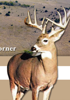
Tracts 5-6 Southwest Corner

TRACT 1: 39± ACRES located at the intersection of 10 Rd & Settler Rd, excellent potential building site & hay meadow with an amazing view of the surrounding Flint Hills landscape. Mostly open with an old homestead located at the northern boundary of the property that has the killer view! Electric & rural water lines are present on the north side of the property.