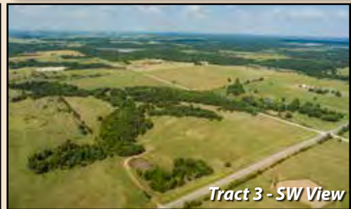
Tract 3 - SW View