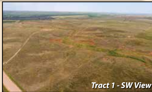
Tract 1 - SW View