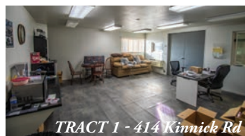
TRACT 1 - 414 Kinnick Rd