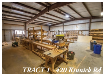
TRACT 1 - 420 Kinnick Rd