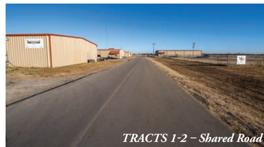
TRACTS 1-2 - Shared Road