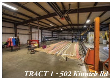
TRACT 1 - 502 Kinnick Rd