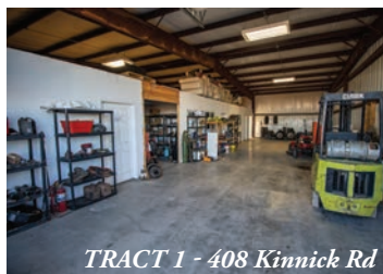
TRACT 1 - 408 Kinnick Rd