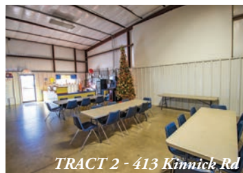
TRACT 2 - 413 Kinnick Rd