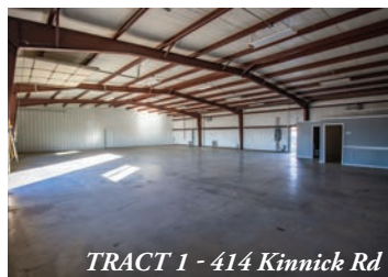
TRACT 1 - 414 Kinnick Rd