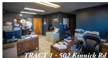
TRACT 1 - 502 Kinnick Rd