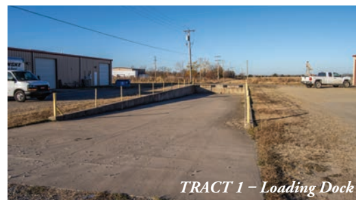
TRACT 1 - Loading Dock