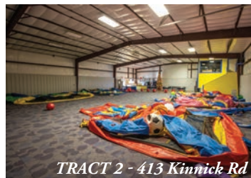
TRACT 2 - 413 Kinnick Rd