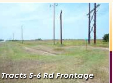
Tracts 5-6 Rd Frontage