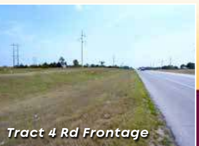
Tract 4 Rd Frontage