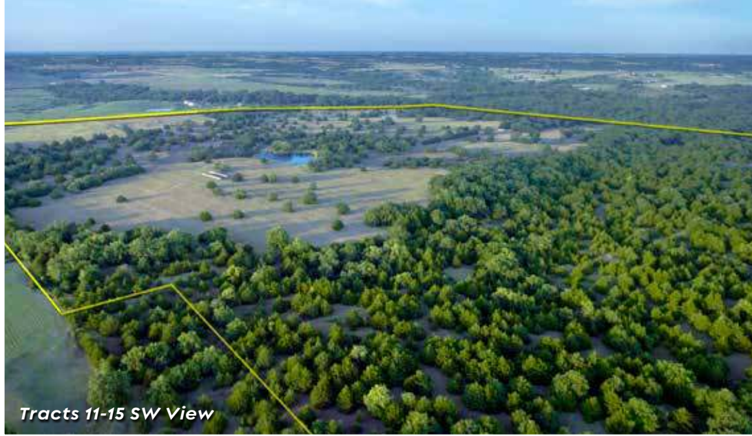
Tracts 11-15 SW View